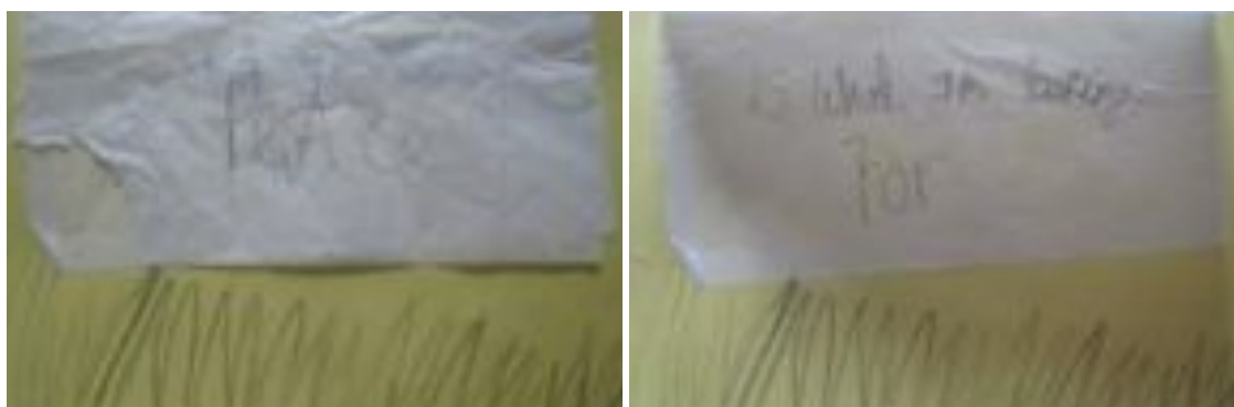
Figure 8: A desire for peace. The figure shows two views (due to a flap) of Alissa's written response from the fourth spiritual collective worship, reflecting on searching for ultimate meaning. It shows that Alissa hoped for finding peace – perhaps either in her own life or the world.